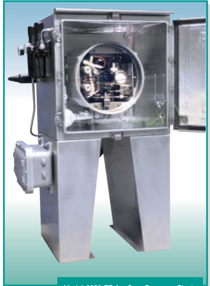
Model 3050-TE for Cryo-Recovery Plants

To ensure you a successful and easy analyzer installation, the 3050-TE is an integrated solution package for your turbo-expander process. It includes all sample handling components from the sample tap through the analyzer.